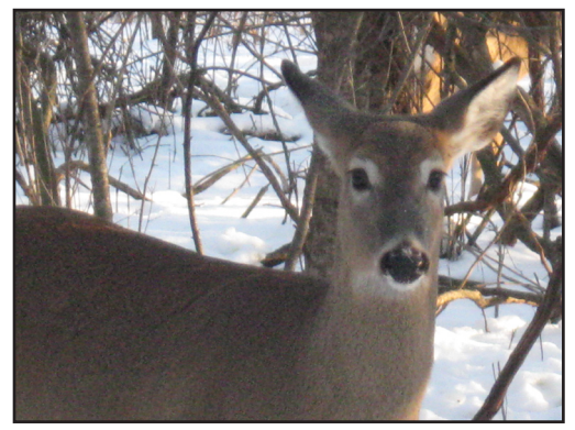
My wife and I took this picture of a deer at the Metropark

In years past, it wasn't an issue to back up your photographs. You used to take your pictures into the store and have them developed. It didn't matter which type it was, slides or photos: Once you got them back developed, you could put them in an