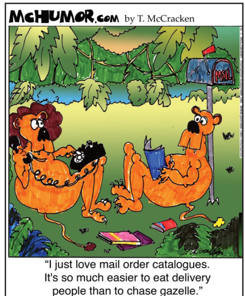
"I just love mail order catalogues. It's so much easier to eat delivery people than to chase gazelle."

If there are a large number of files you