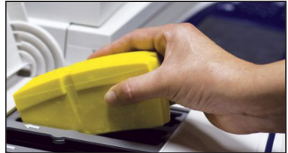
A new multifunction printing technology has been announced by Xerox which uses solid inks and manages to reduce printing cost of color pages up to 62%.

4. Clean your printer frequently. Faint output, unprinted lines running across the page, or streaks on your printouts can indicate clogged nozzles or a dirty printer. Check your user's guide for the