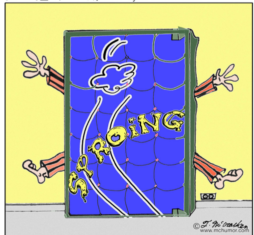
Murphy's Bed meets Murphy's Law.